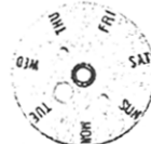
☆ 870410 ☆ 870418