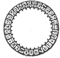
☆ 801410 ☆ 801418